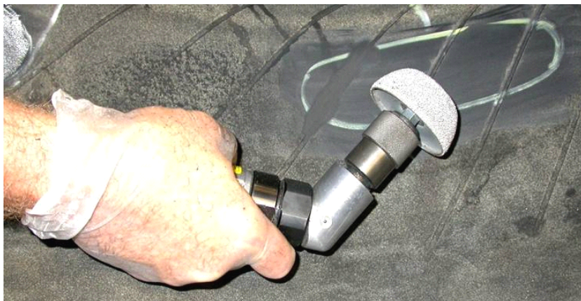
Buffing outlined area to achieve a smooth with Grinding Wheel