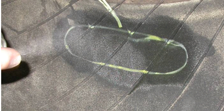
Applying cleaner fluid to the outlined area